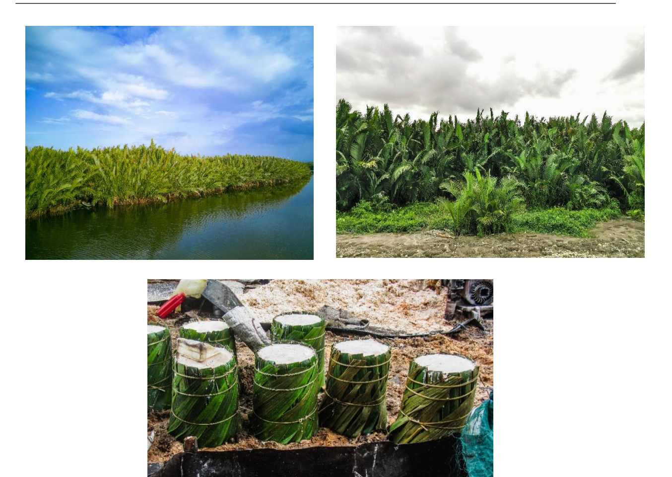
Figure 2. (a) Sago palm trees on the bank of a river (b) Sago palm trees that flourish; (c) Wet sago flour wrapped in pandan leaves

The Ministry of Agriculture/Government of Indonesia (2018) reported that sago starch consumption was 0.36 kg/capita/year or -0.12% of average growth from 2014 to 2018 (Table 2). It is hypothesized that sago production in the eastern part of Indonesia could empower the acceleration policy on diversifying food consumption based on local sources as mandated in Presidential Decree No. 22 Year of 2009. The regulation is one of the policies to promote food diversification consumption of local food such as cassava, corn, sorghum, and sago. In addition, the current food policy in Indonesia is Laws of the Republic Indonesia No. 18 of 2012 concerning food. Specific policy on Papua is Government Regulation No. 65 of 2011 concerning the Acceleration of the Development of the Provinces of Papua and